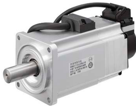
MINAS A6 Series, Battery-less absolute encoder motor Output: 400 W