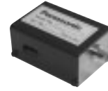
Acousto-Optic Tunable Filters