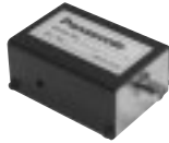
Acousto-Optic Light Modulators